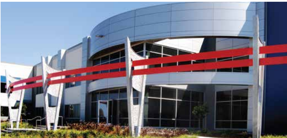
Thermo Fisher Scientific