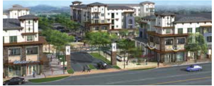
Artist Walk (located in Centerville)