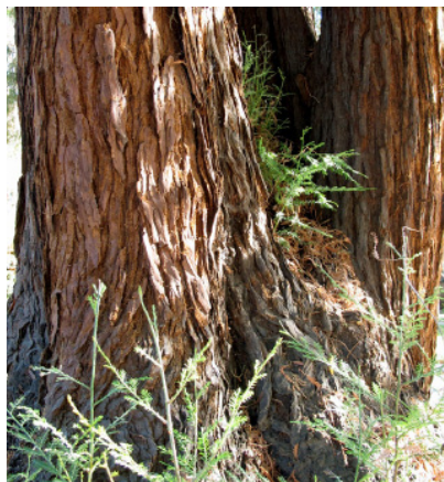
This specimen displays a split trunk structure, a feature rarely found in Coast Redwoods.