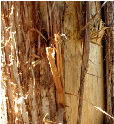
Close-up detail of the bark of a Canary Island Juniper Pine.