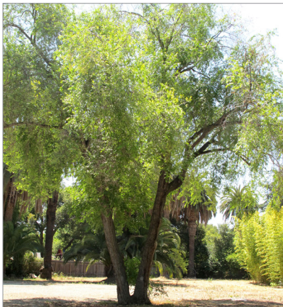
One of the three landmark Siberian Elms with a split-trunk.