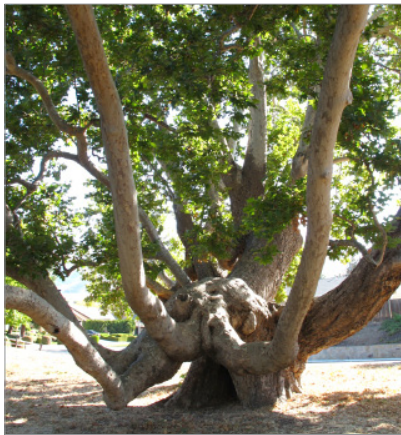
Uniquely grotesque branching pattern.