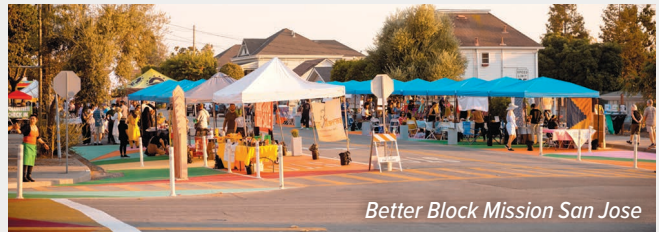
Better Block Mission San Jose

We're also looking ahead to future projects. During the last legislative cycle, Fremont secured over $20 million in State funding largely