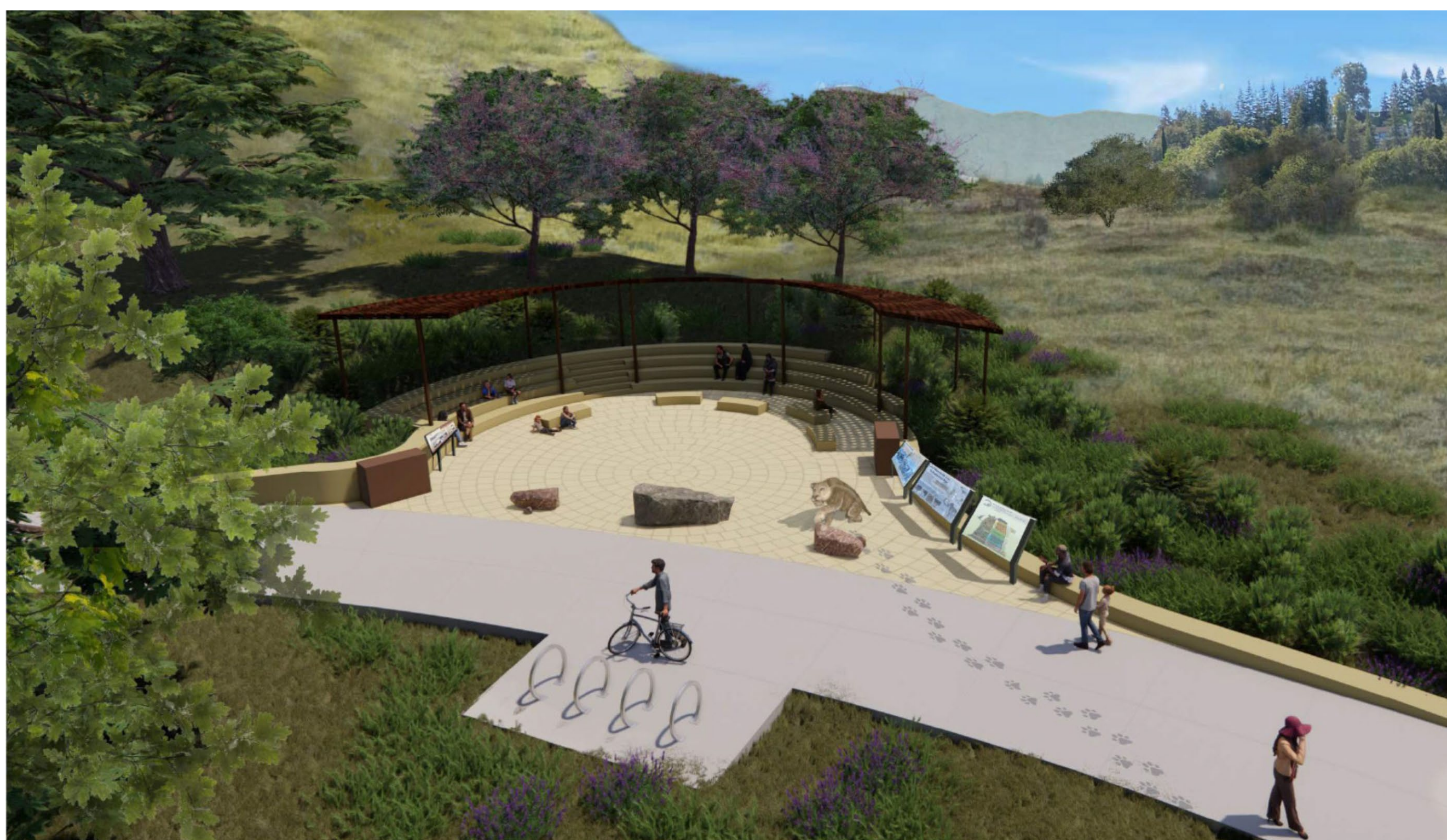
Rendering of Interpretive Area to learn about paleontology and past history.