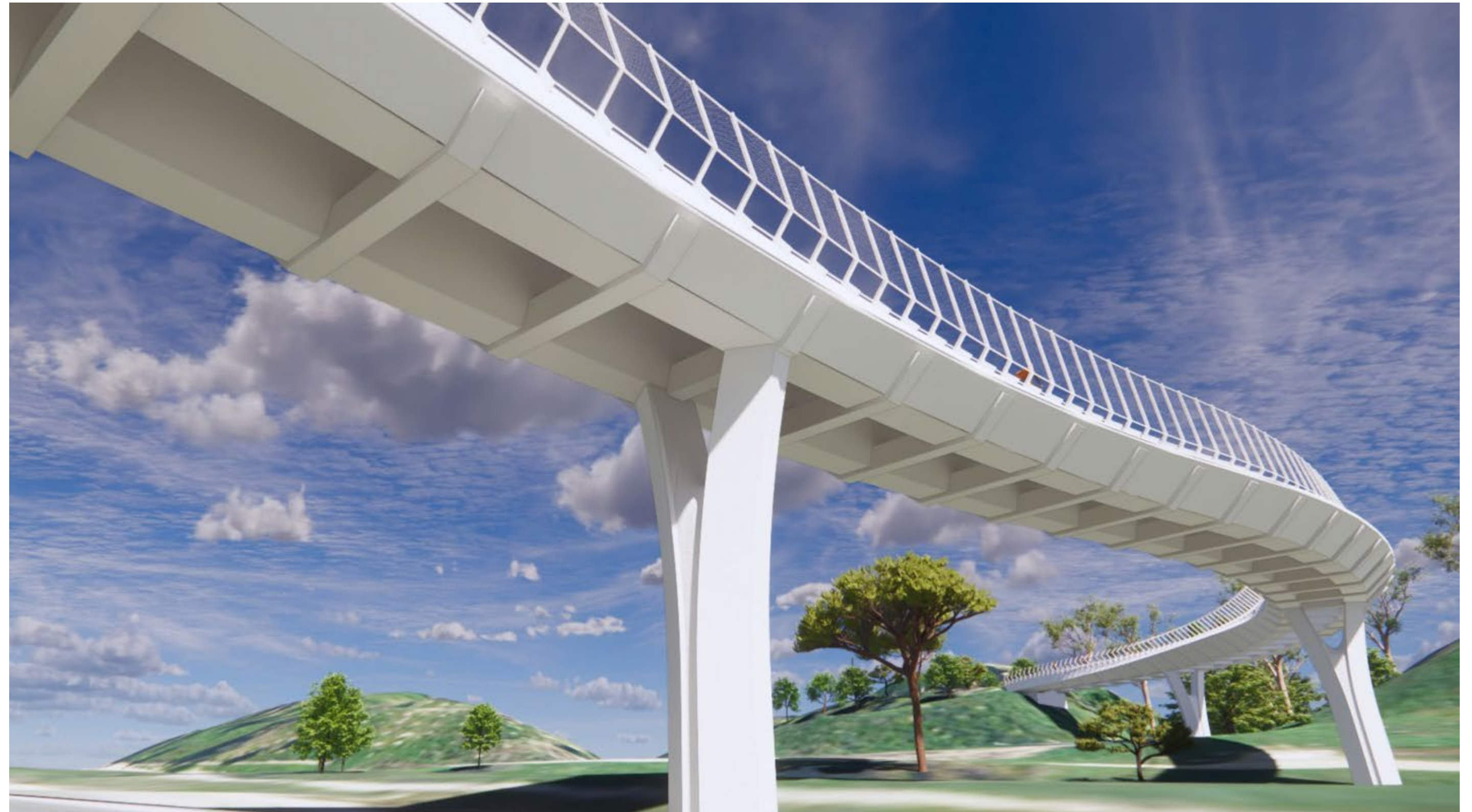
Planned “fossil” bridge design for Sabercat trail extension over Interstate 680.

The proposed Sabercat Trail project will extend and improve the existing trail, located in the Mission San Jose area. The project will extend the trail to the west over Interstate 680 to connect with the Irvington community at Osgood Road. The existing trail will be widened, improved, and extended easterly along Pine Street to connect with Mission Boulevard and Ohlone College. A new interpretive area will inform the community about the unique paleontological history of the area from 1.9 million years ago.