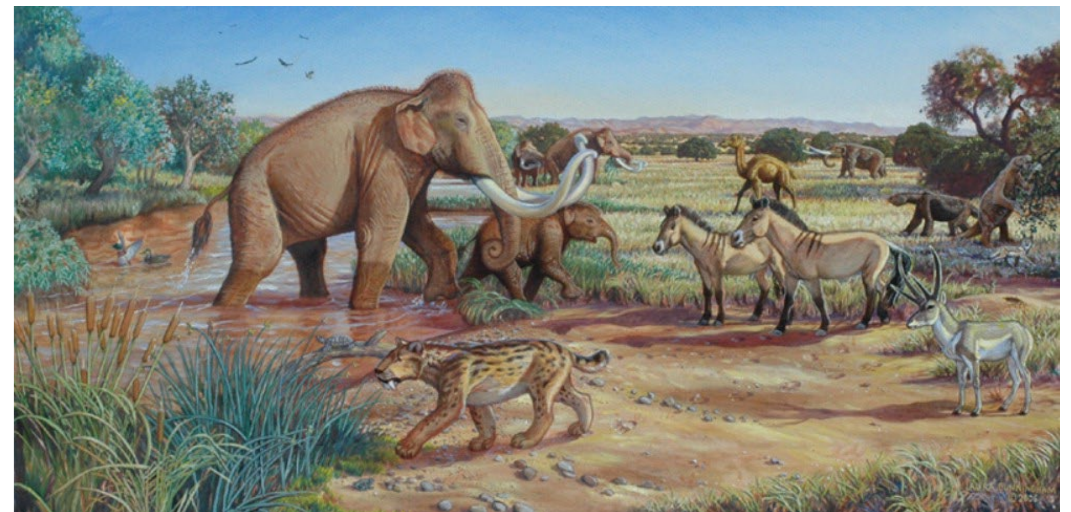
Illustration of Fremont 1.9 million years ago.

*Schedule subject to funding availability