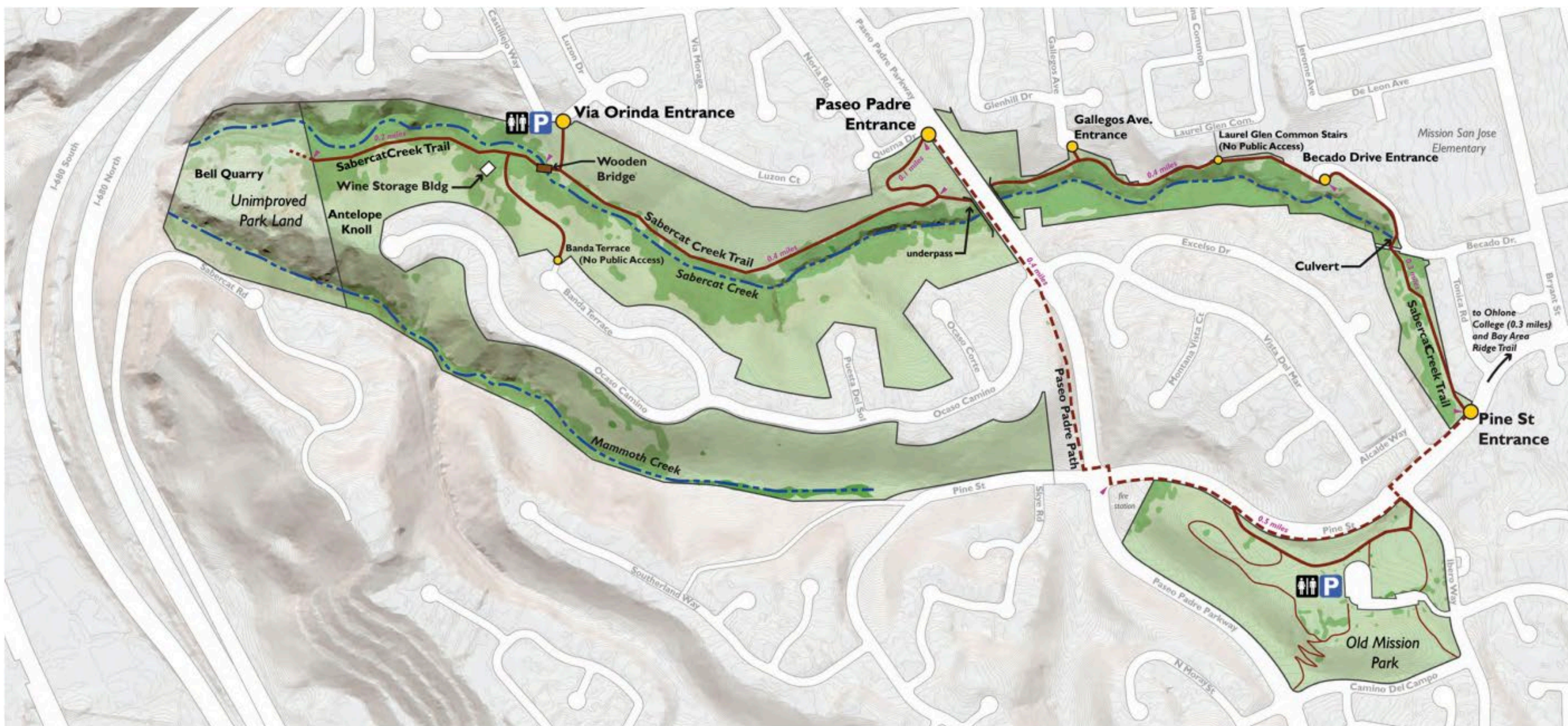
Map of Sabercat Historical Park and existing trail.

Funding grants from the Alameda County Transportation Commission and the California Natural Resources Agency have allowed completing the project scoping, planning, and environmental clearance phases. In February 2022, the Fremont City Council unanimously approved the project and authorized continued work on final design, land acquisition, and pursuing funding for construction. In September 2022, new State grant funding ($12 million) was approved that will allow the project to be ready for construction starting in 2025. Additional funds are needed to fully fund the construction phase and will be pursued from regional, state, and federal sources. To allow portions of the project to advance with partial funding for construction, a phasing plan has been proposed: Phase 1, upgrade existing trail; Phase 2a, relocate an existing I-680 toll sign that conflicts with the new bridge; Phase 2b, build Sabercat Trail extension to the west with new bridge over I-680; and Phase 3, extend east end of Sabercat trail to connect into the Ohlone College campus and the hiking trail to Mission Peak and the Bay Area Ridge Trail.