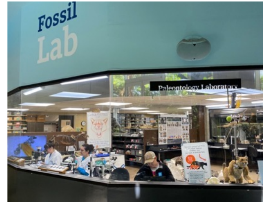
Photos from Page Museum, La Brea Tar Pits (Exhibits, Theatre, Working Fossil Lab)