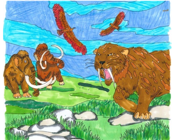
Recent youth coloring contest submission