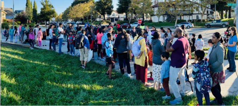
Forest Park Elementary