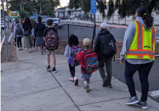
Vallejo Mill Elementary