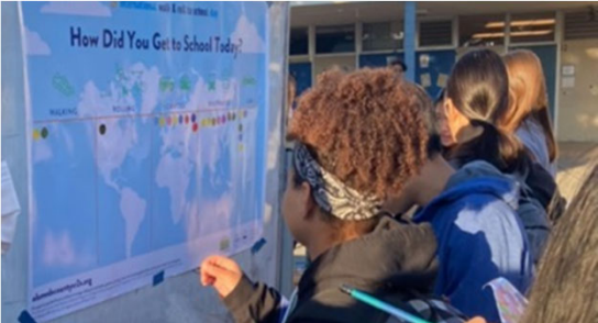
Irvington High School