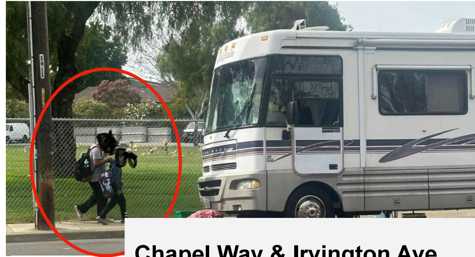
Chapel Way & Irvington Ave