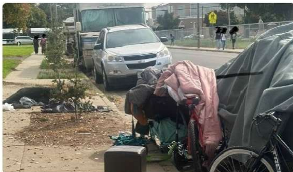
Started October 20, 2023