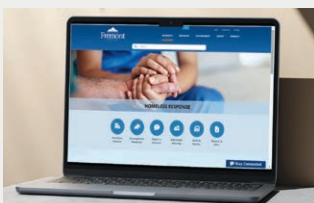
Homeless Response 4