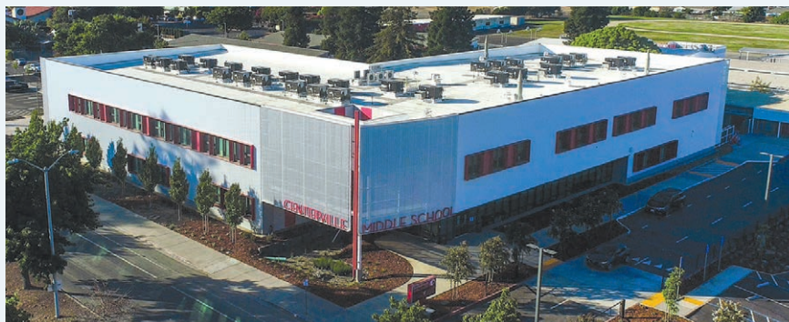
Centerville (pictured), William Hopkins and Thornton middle schools welcomed 6th grade students this school year. G. M. Walters and John M. Horner converted to the middle school model in 2019 and 2020, respectively.

The City of Fremont hosted Manufacturing Week in October, working with local companies to open their doors for FUSD students to learn