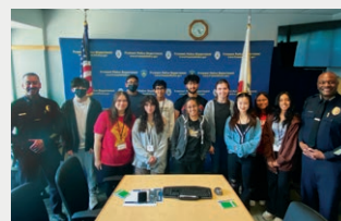
FPD's Community Engagement 7