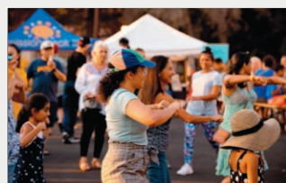
Fremont Districts 5