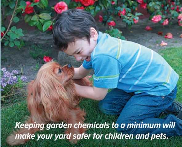
Keeping garden chemicals to a minimum will make your yard safer for children and pets.