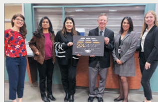
Advancing Solar Energy 6