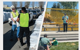
Compost Giveaway & Earth Day 9 & 10