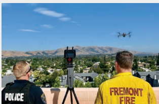
Drone as First Responder 5