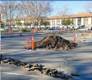
Temp. Housing Nav. Center