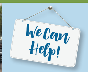
Rental Assistance Program