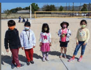
Summer Camps & Programs