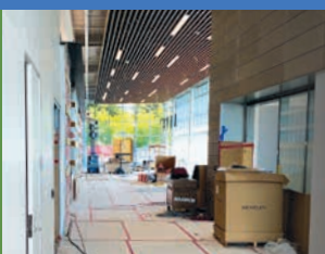
Downtown Event Center