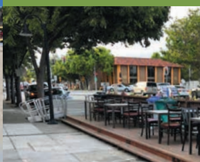
Centerville Complete Streets