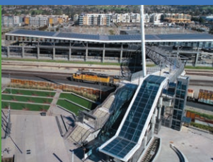
West Access Bridge