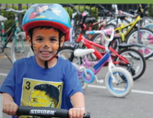
Earth Day Fair