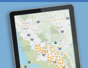
Agency Counter Website