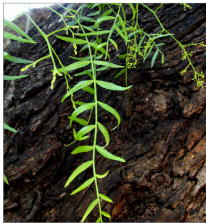
Close-up of the lanceolate-shaped leaves and trunk detail.