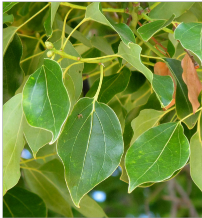
Glossy yellow-green leaves.