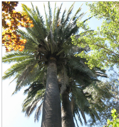
View of leaves ground-level.