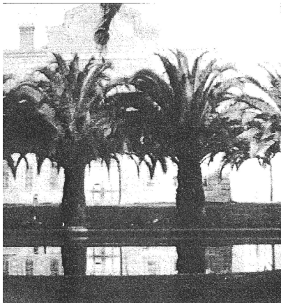
Photo showing the palms in front of the Gallego Winery before the 1906 earthquake.