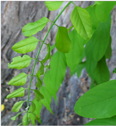
Fast growing deciduous tree. It has pinnately compound leaves, and long clusters of fragrant white flowers. 17