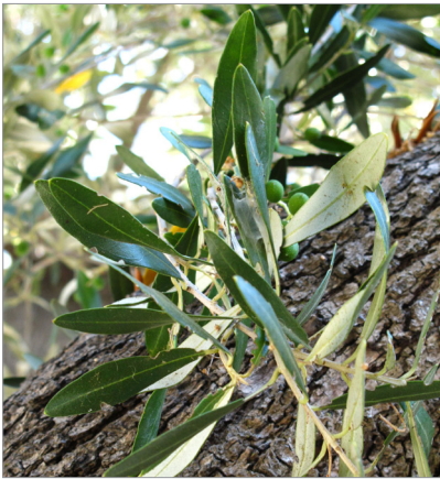
Smooth-margined leaves and olives.