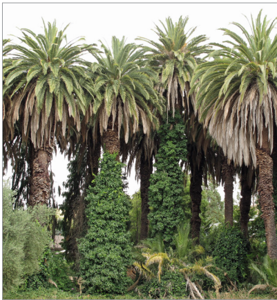
View from St. Joseph's Terrace.