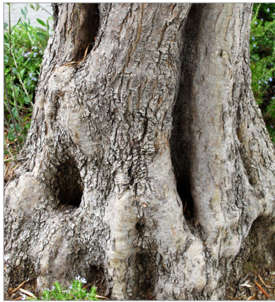
Base of an Olive tree.