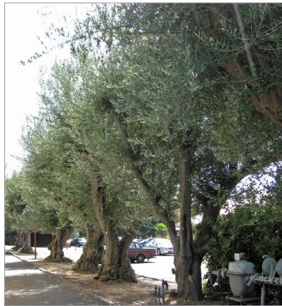
Lanceolate leaves; distinctive trunk texture.