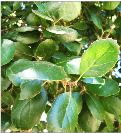
Oval leaves with spiny-toothed margins.